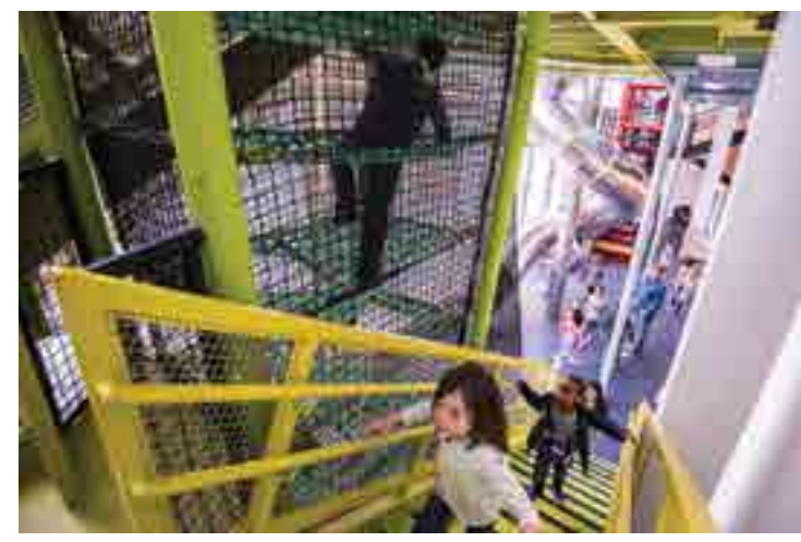
Ribbon Cutting June 7, 2017 Opening the doors with cheers of joy