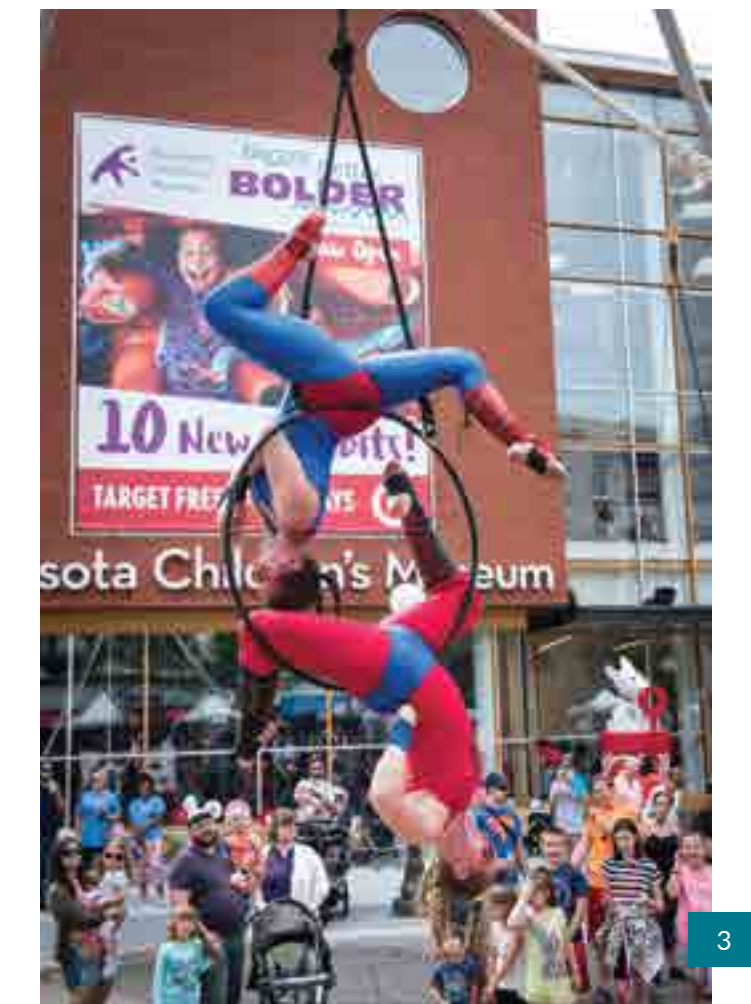
Block Party June 17, 2017 Food, fun, music and smiles galore