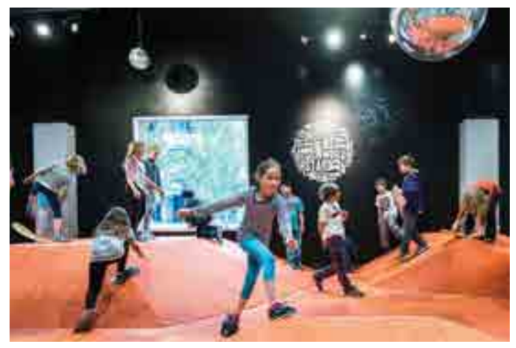
Sneak Peek June 2-6, 2017 Lucky visitors put fun to the test